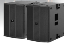
62LA ACTIVE LINE ARRAY