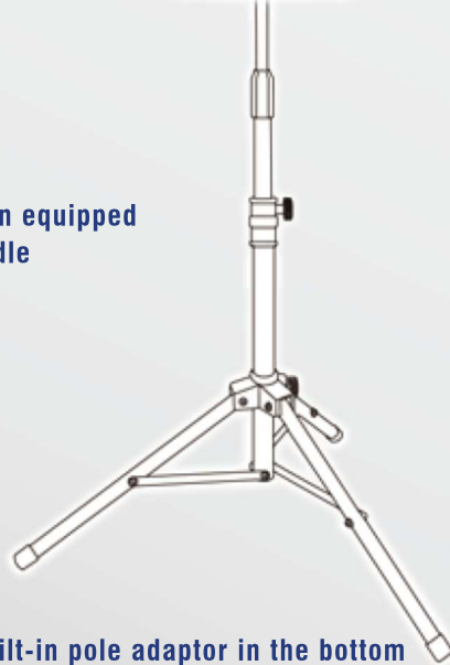
Built-in pole adaptor in the bottom

An ideal solution for mobile application equipped with two casters and a telescopic handle